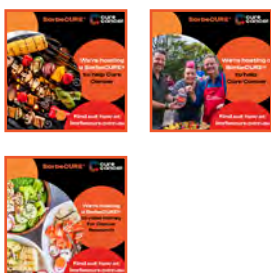
BarbeCURE® Social Media