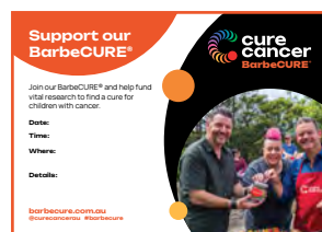
BarbeCURE® Newsletter Ad