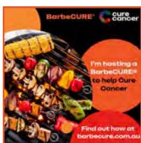
BarbeCURE® Social Media

Why not stock up on some extra merch to sell at your BarbeCURE®? We've got everything from kids aprons, tongs, stubby holders and more available to buy on the website: curecancer.com.au/shop