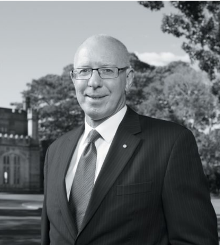
His Excellency General The Honourable David Hurley AC DSC (Ret'd) Governor of New South Wales

As Patron of Cure Cancer, I believe it is only through research that we will cure cancer. Many of us will have lost someone we love to this cruel disease and we are all united in our wish to see a cure for cancer in our lifetime.